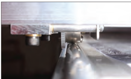
The Bliss™ track system dramatically reduces friction and increases ease of movement.

Our exclusive Bliss™ track system is easy to maintain. Unlike other channel systems on the market, the APQS rail profile prevents dirt and thread buildup so you can spend more time quilting and less time cleaning. No adjustments are needed – all you have to do is quilt! This technology can be added to the Millennium, Freedom, Lucey and Lenni sewing heads.